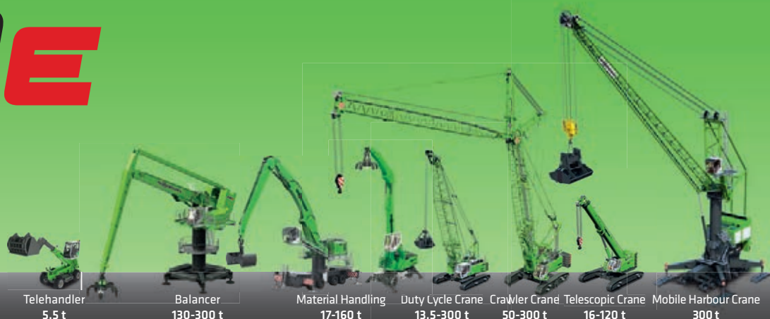
Telehandler 5,5 t